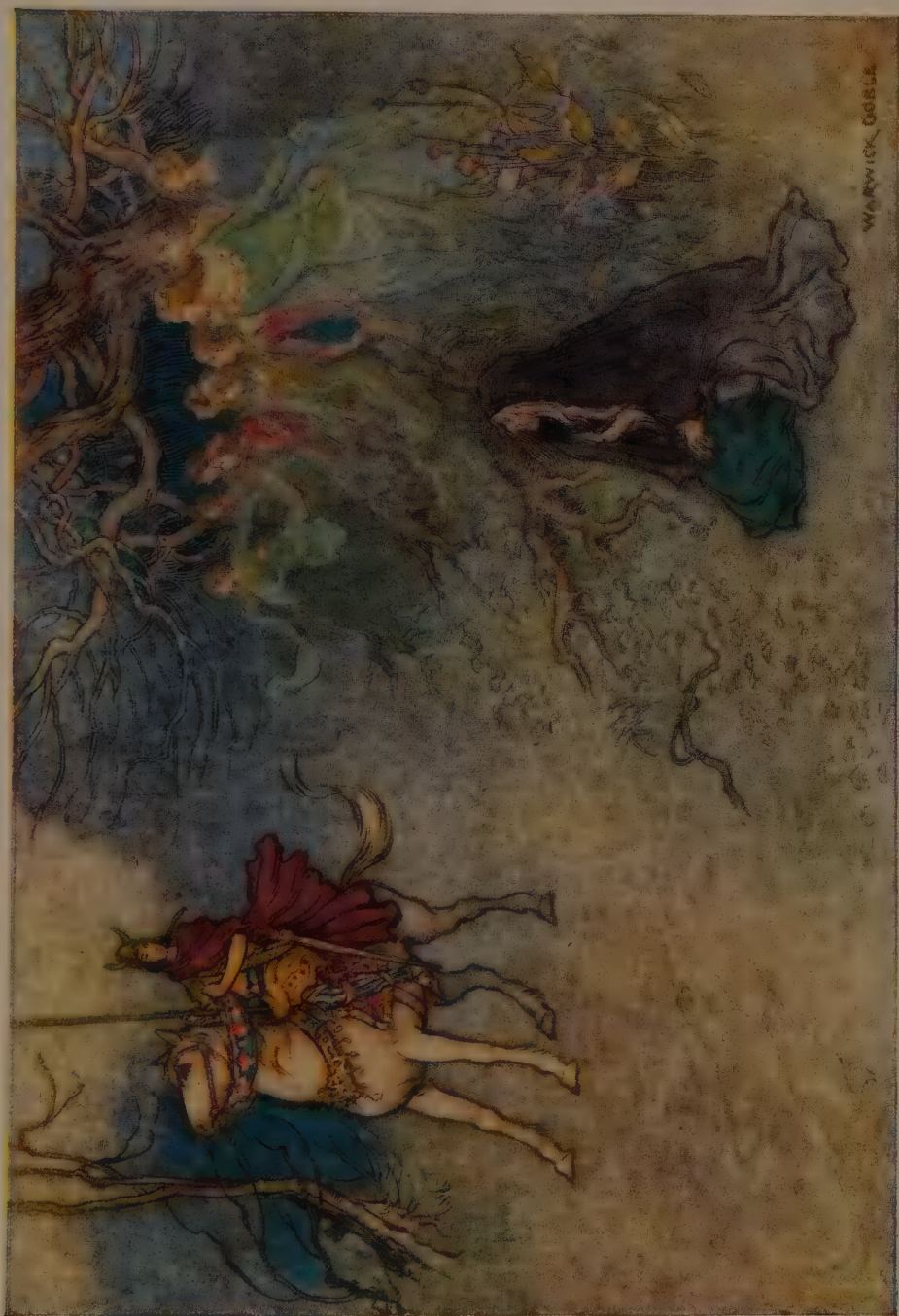
THE KNIGHT AND THE OLD WOMAN